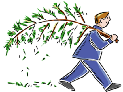
Removing of the Greens

Unhanging of the Greens will be January 12 following Sunday Morning Worship.